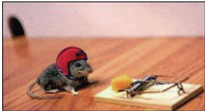
The Tabernacle's resident church mouse, philosopher and occasional complainer

Why is it that I'm always getting challenged in my most vulnerable areas? I try to hide my wimpiness with a macho fa-