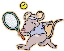
The Tabernacle's resident church mouse, philosopher and occasional complainer

Quickly, I ran back to my hole so I could think about what I had heard. Maybe I could help another mouse find a home. Or, maybe I could warn other mice about dangers in the area (you, know, like cats). The possibilities are endless. Now, I can hardly wait for each new day to see how God will use me for his Kingdom purposes.