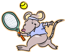
The Tabernacle's resident church mouse, philosopher and occasional complainer